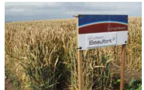
Yield expressed as a % of Mackellar, Source: NVT South West Victoria 2000–2009 Long term trial data.